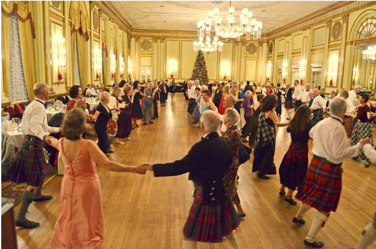
Gleneagles Grand Ball 2012