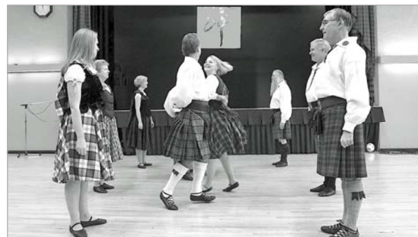
Demonstration Team at Marpole Dance Festival

The Vancouver Branch Demonstration Team would like to invite everyone to come along to their "Open Night" evenings.