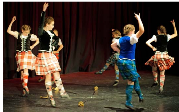
Invergleng Scottish Dancers

Publication of the White Cockade is the first of September, November, January, March and May. Annual subscription is included in your $50 RSCDS Branch membership fee.