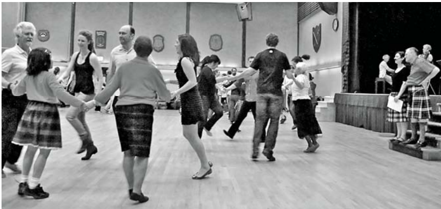
Duncan's Ceilidh at the Scottish Cultural Centre